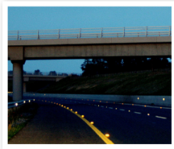
Cat's eyes are light reflectors