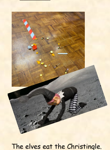
Children get a message from a very lonely Moon Elf.