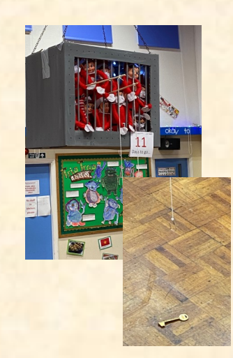
The elves attempt to escape by fishing for a