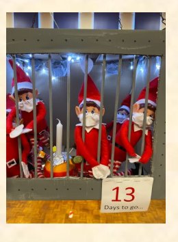
The elves steal a Christingle....