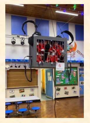
The elves sing a very irritating song over and over again