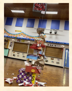
The elves opened lots of presents and tried to pile them up to escape