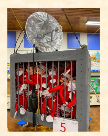
The elves build a satellite dish. Are they trying to communicate with someone?