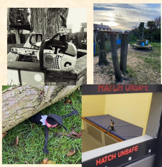
Moon Elf cuts down the trees in Early Years. A branch traps him . He is arrested and taken to the police station.