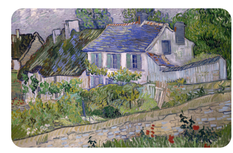
Houses at Auvers by Vincent van Gogh, 1890