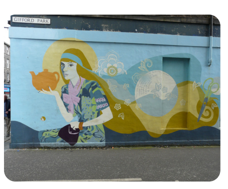
The Gifford Park mural by Kate George, 2015

A mural is a large picture that is usually painted onto a wall, ceiling or other structure.