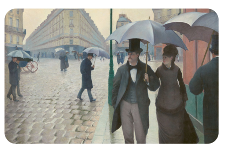
Paris Street; Rainy Day by Gustave Caillebotte, 1890